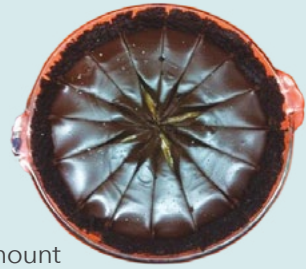
Dark chocolate salted caramel Oreo pie